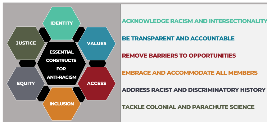
Fig. 1 Six essential constructs for effective anti-racism.

performance in their hiring, promotion, and related constructs as well as audits that show how they value research and scholarship that is meaningful to diverse communities, for example, community-inspired research that can build trust and broaden participation of Native Americans 21 . These audits should also have an impact on their potential for future funding, program accreditations, their ranking, and prestige.